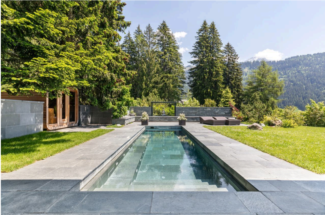
Swimming pool / Jacuzzi