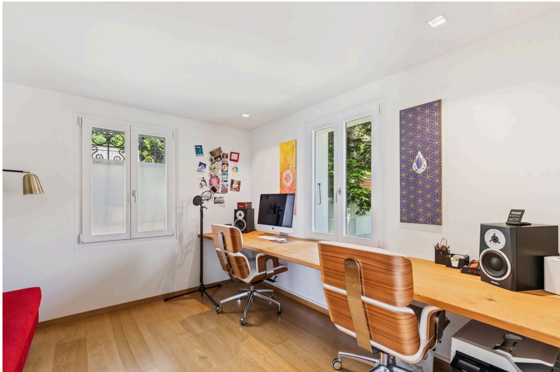
Office / Bedroom