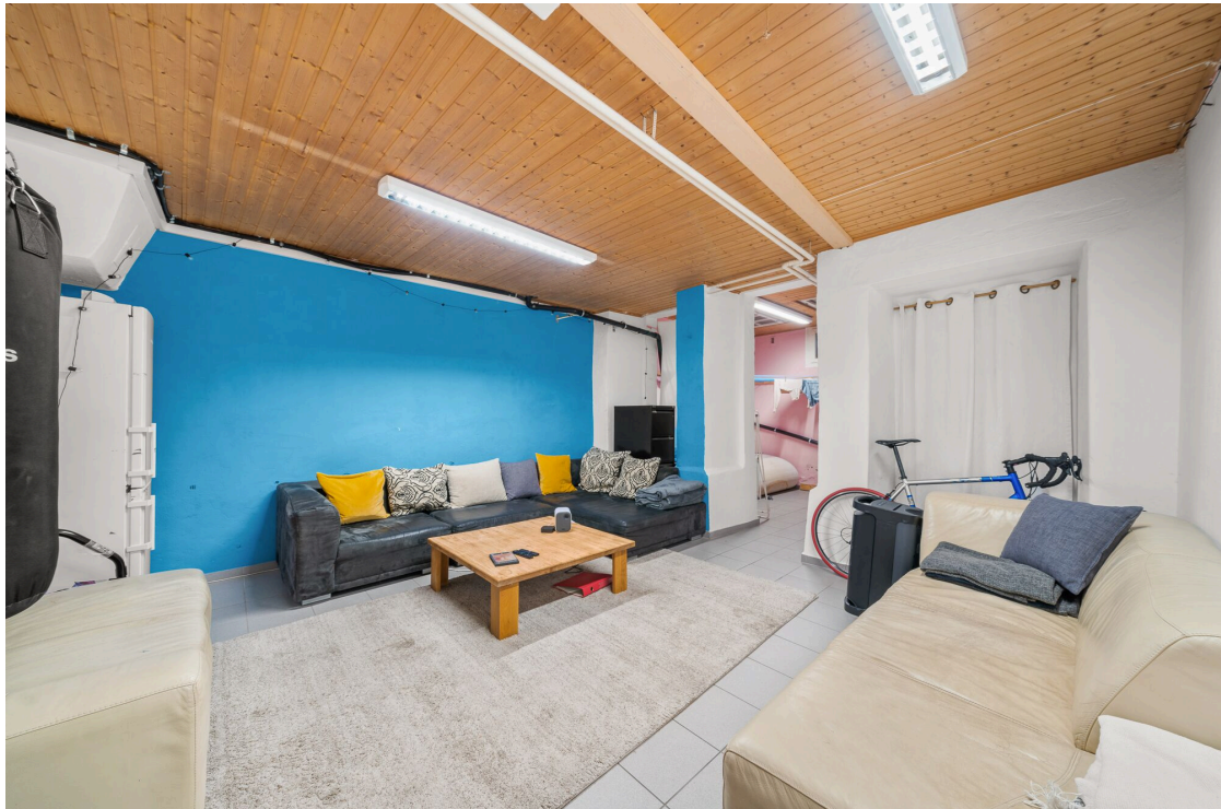
Available and laundry room