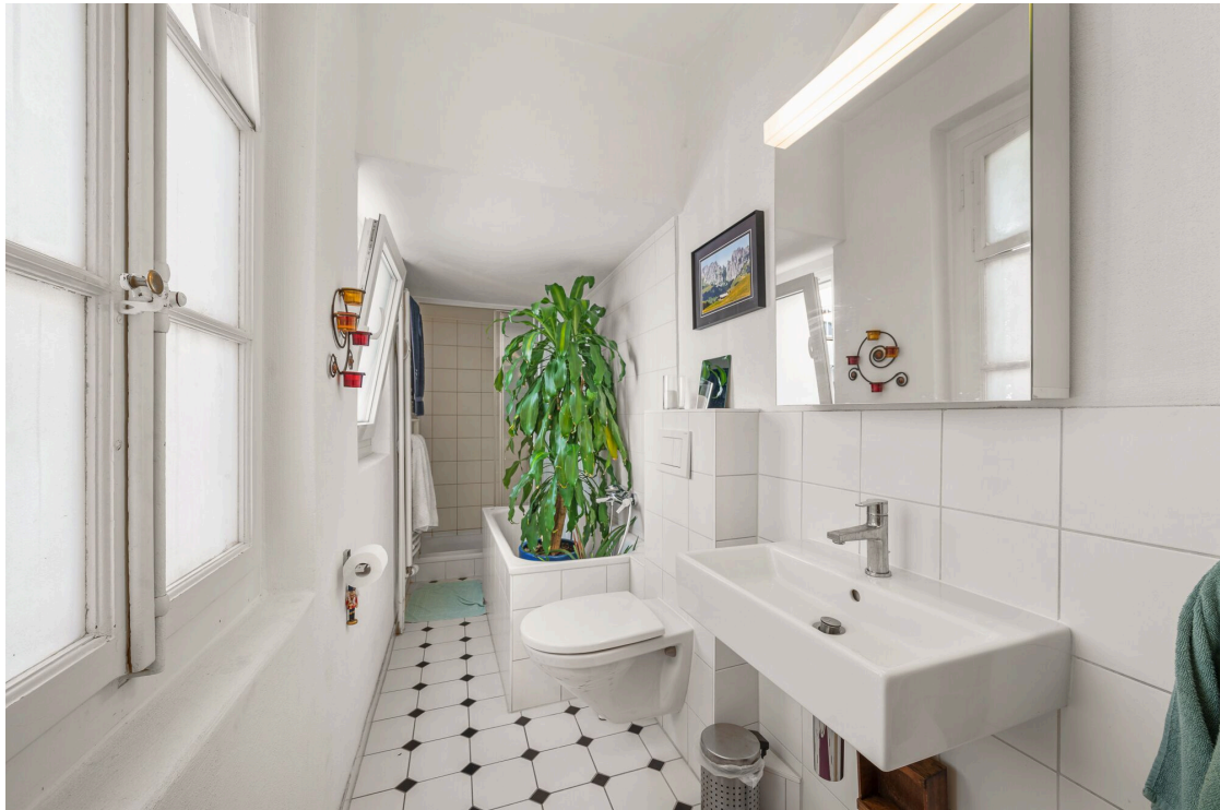
Shower and bath