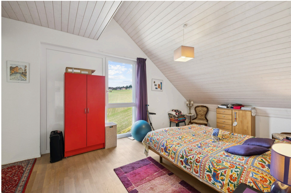
A bedroom with a large bed and a large window on the ceiling