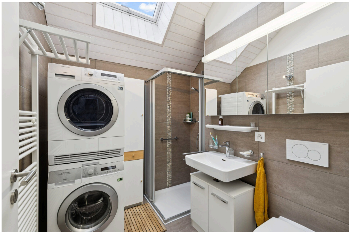
A modern bathroom with a white toilet, sink, shower and washing machine in a small attic