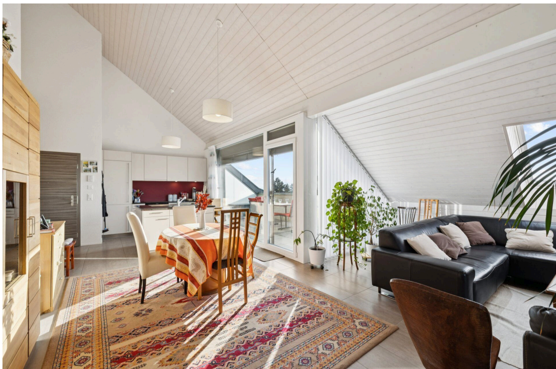
A large room with a table and chairs and a living room and dining area with a view into the kitchen