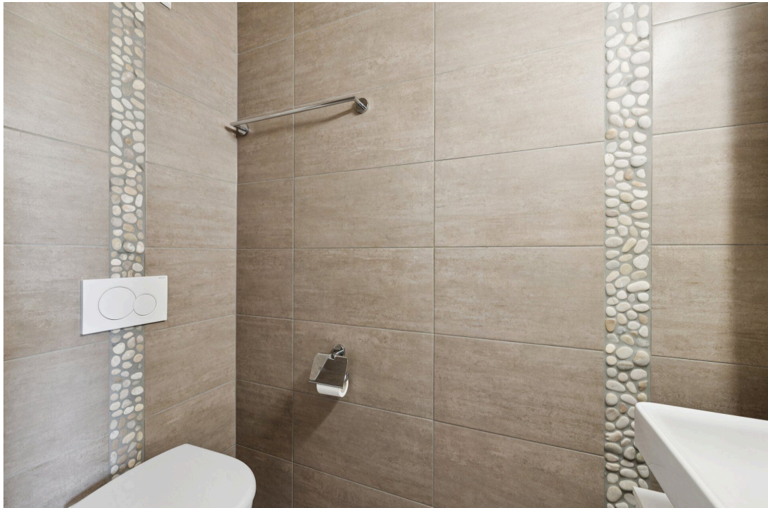
A bathroom with a white toilet next to a walk in shower