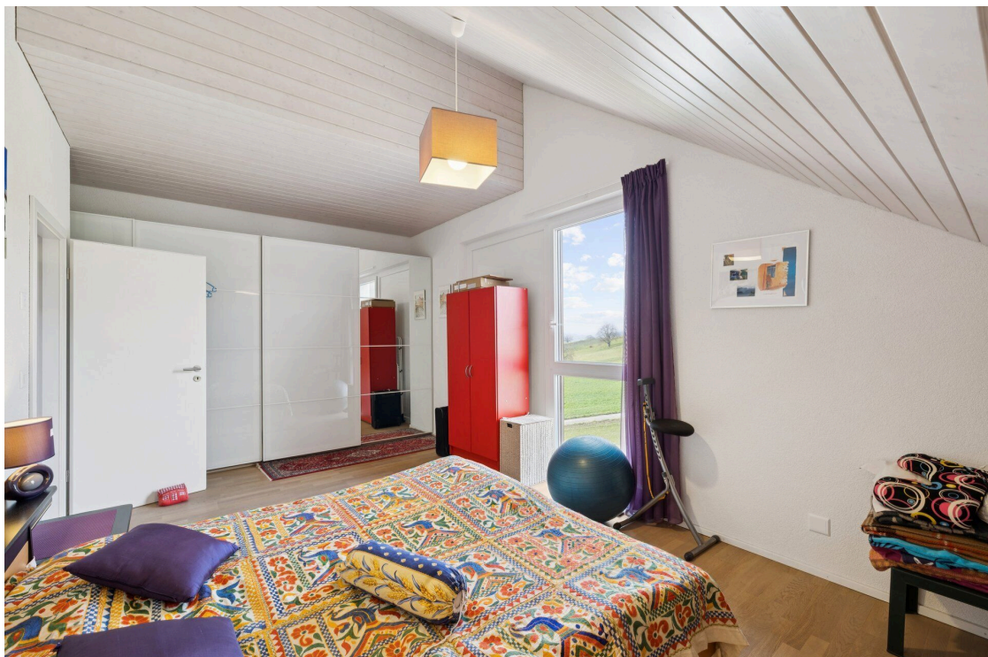
A white bedroom with a large bed in it