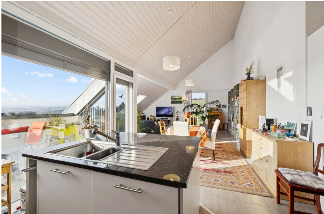
The kitchen and living room of a modern house