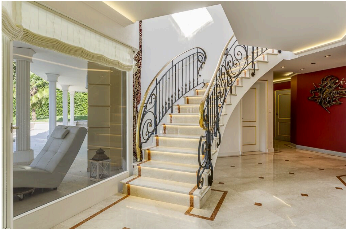
Stairs in marble