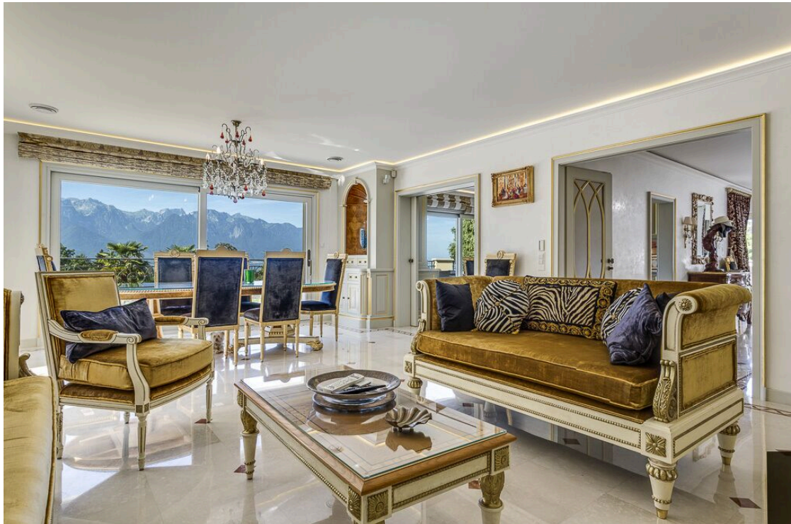
Living room and dining room