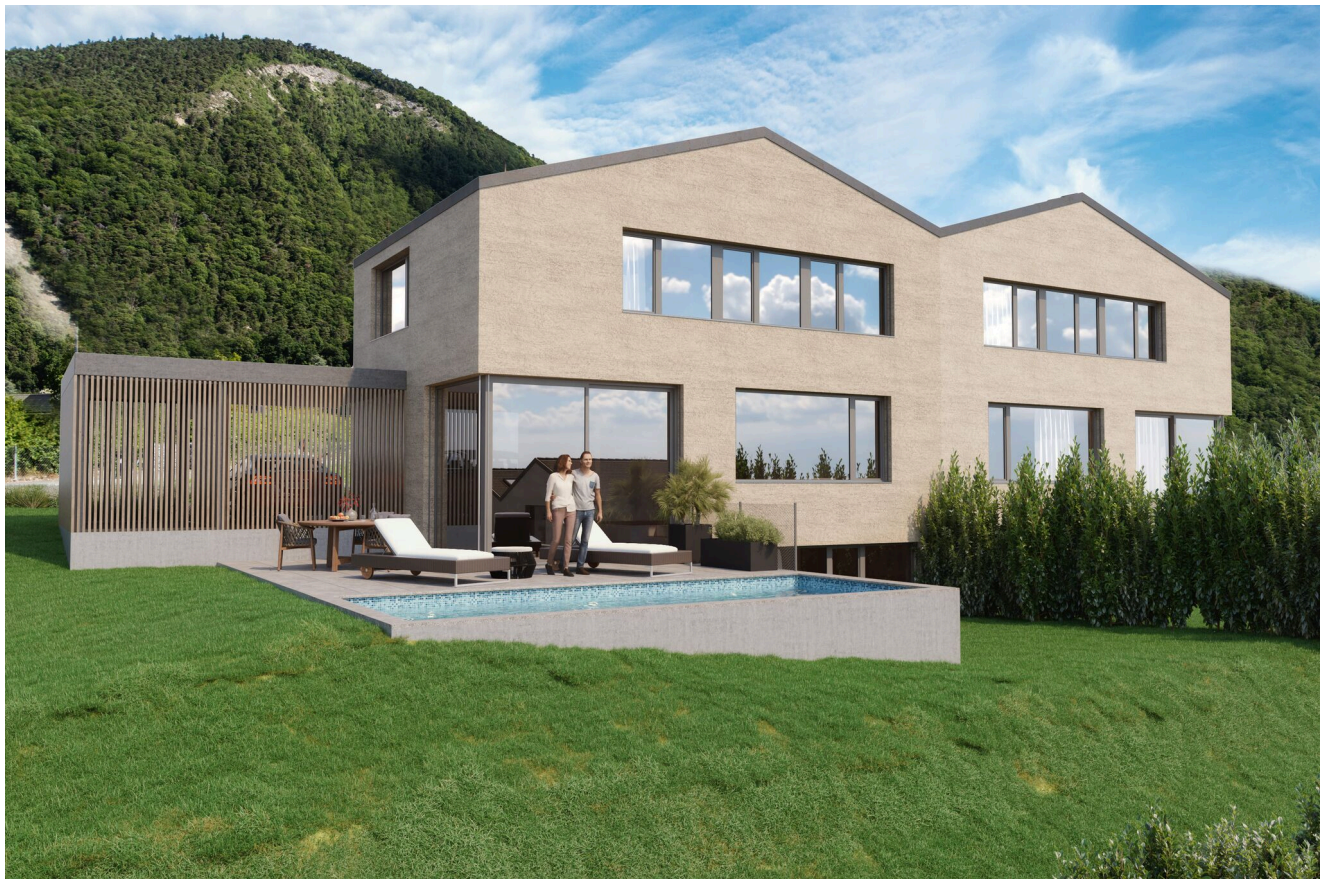
Architect-designed villa (A4) Le Clos d'Arbosson