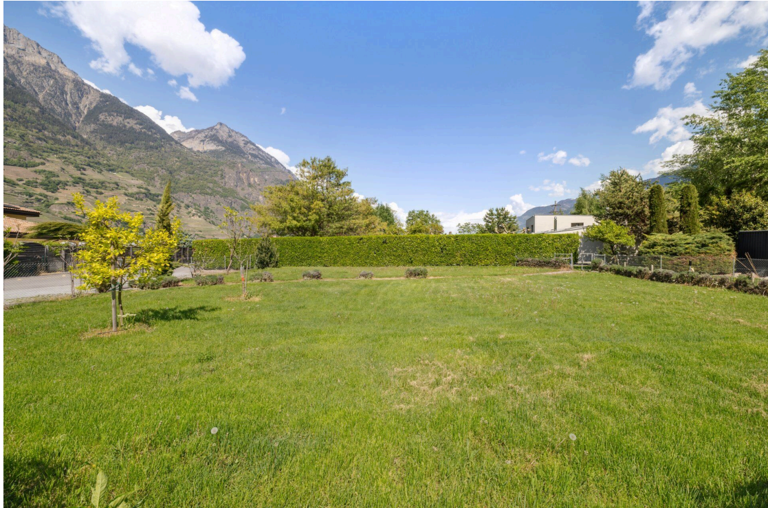
1002m2 plot in SUS