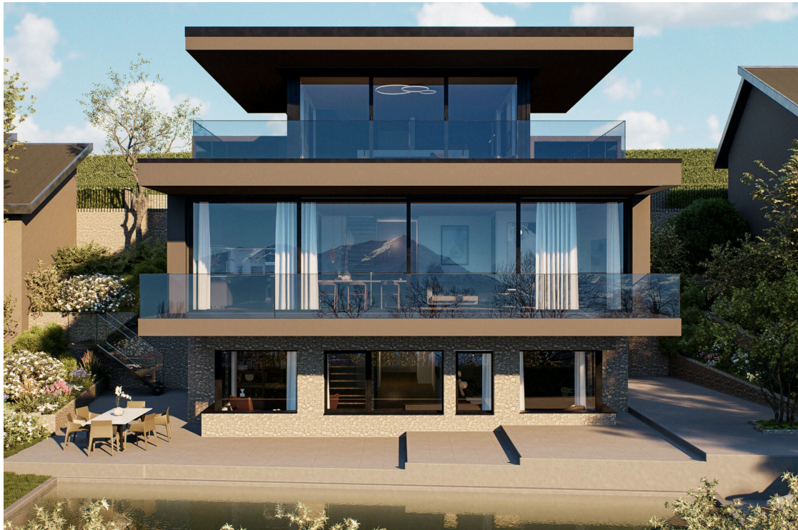
Terrace with pool