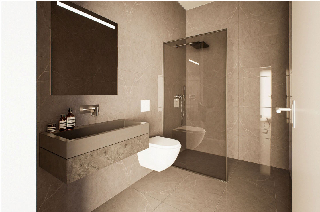
One of the shower rooms