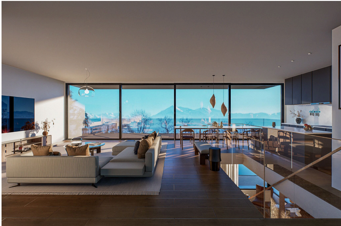
Living room with paronymic view