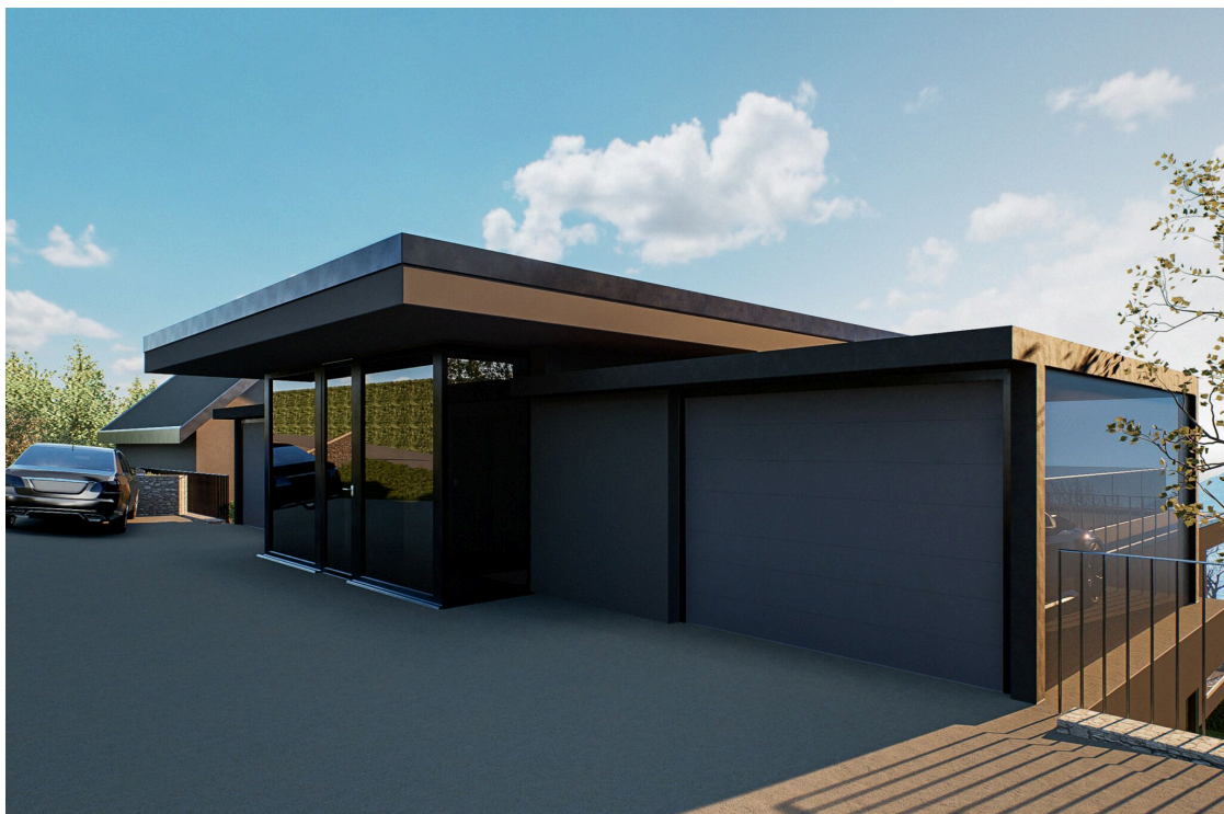
Parking with two garages