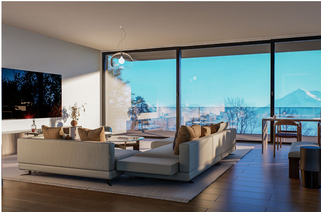
Large south-facing sallon