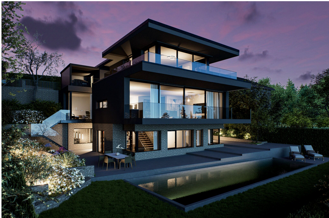
The south facade