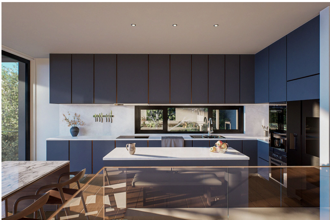
Bright open kitchen