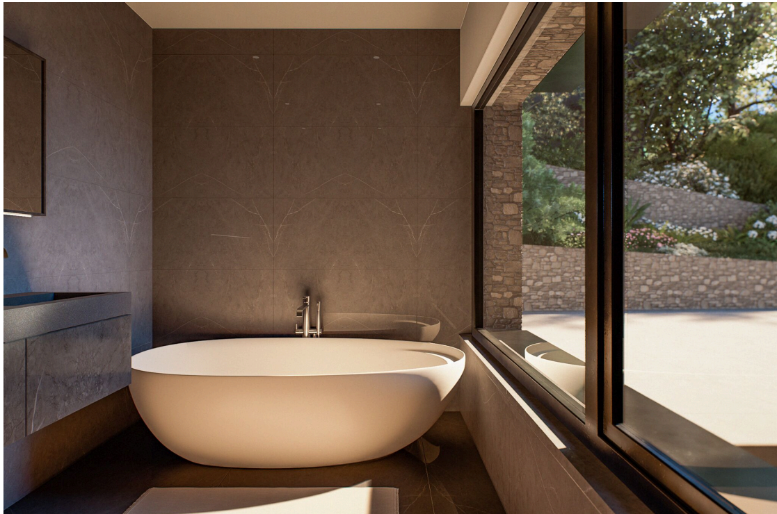
Bathroom in ground floor suite